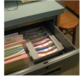
Lies flat in a drawer