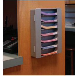
Hangs securely on the wall