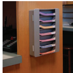
Hangs securely on the wall