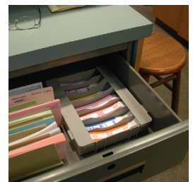
Lies flat in a drawer