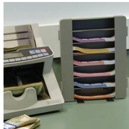
Stands firmly for counter use