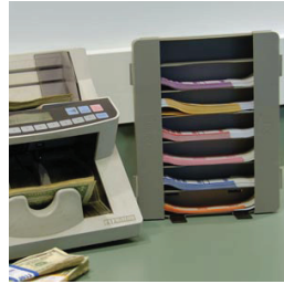
Stands firmly for counter use