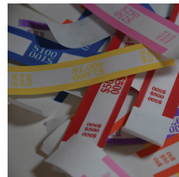
No more of this...