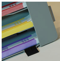
Removable support foot

© 2009 Office-Aid Solutions, Inc. Printed in the U.S.A.