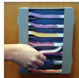
Attaches to the wall with 4 small screws (not included)