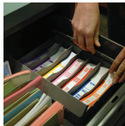
Loading straps is easy